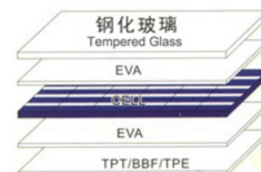
FIGURE OF STRUCTURE